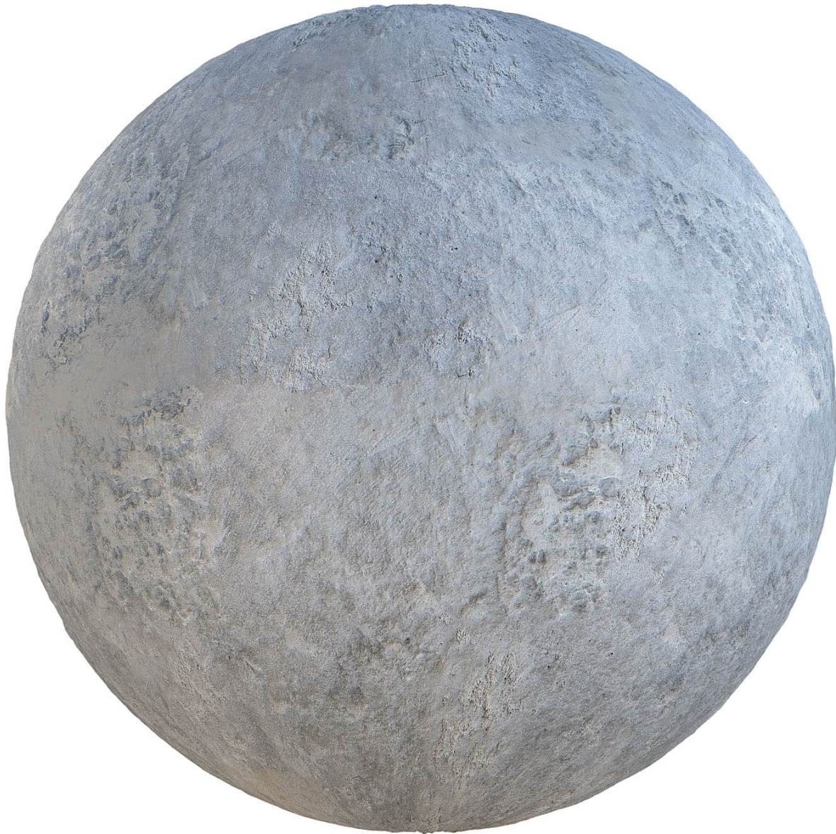
arev concrete 28